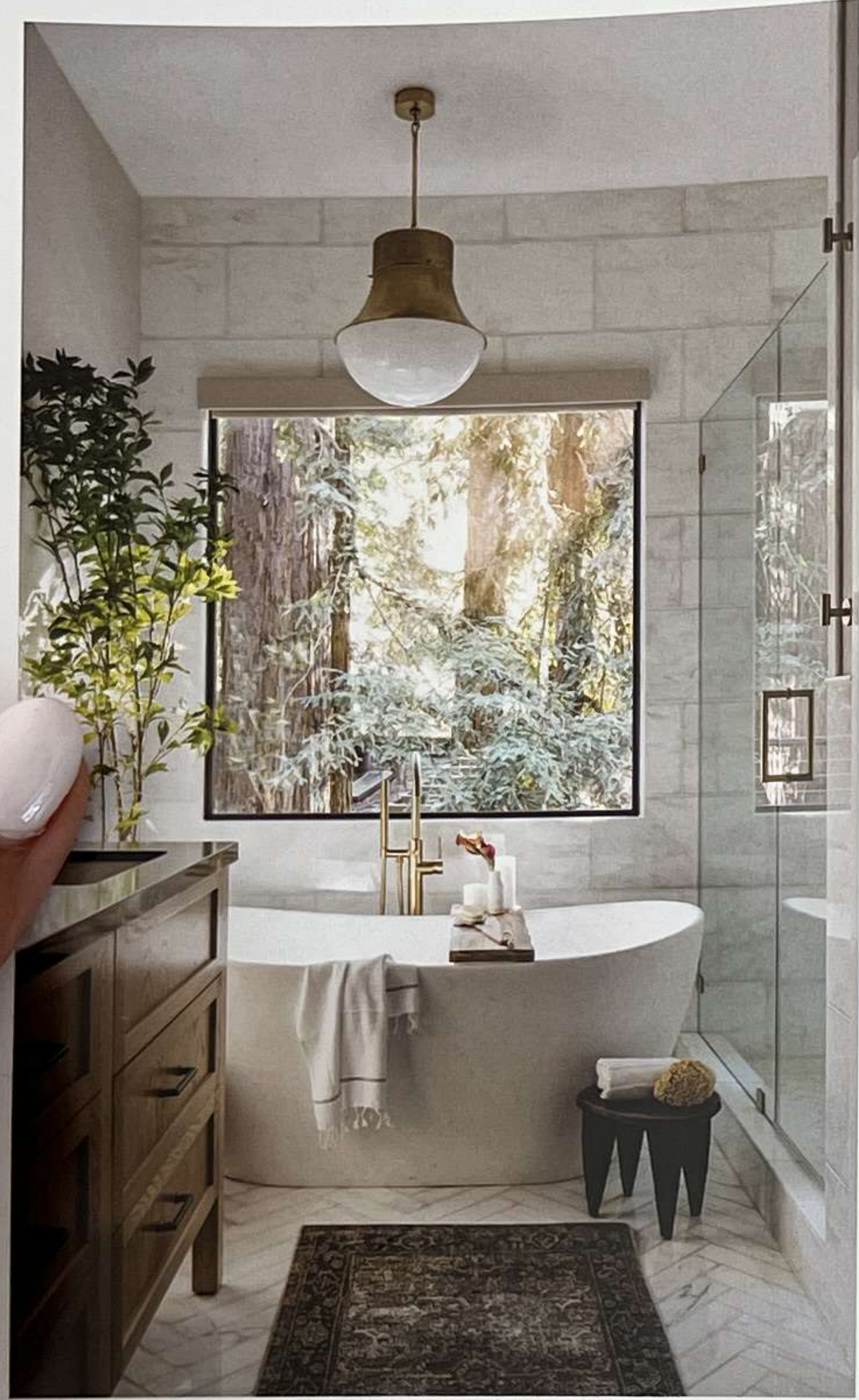
Designed by Natalia Avalos Interiors, San Francisco, CA, page 366

So get cooking, draw creations by these most