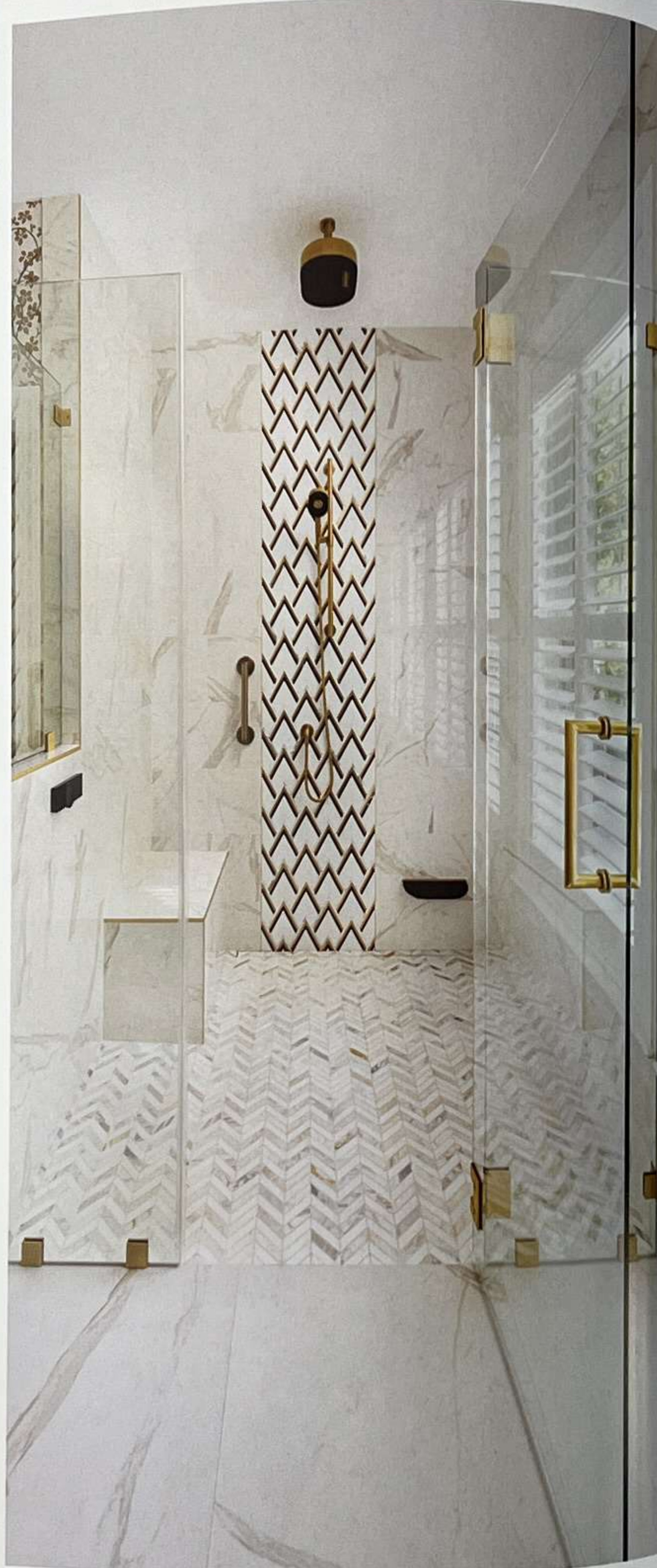
Designed by Barbara Hayman Designs, Orlando, FL, page 361