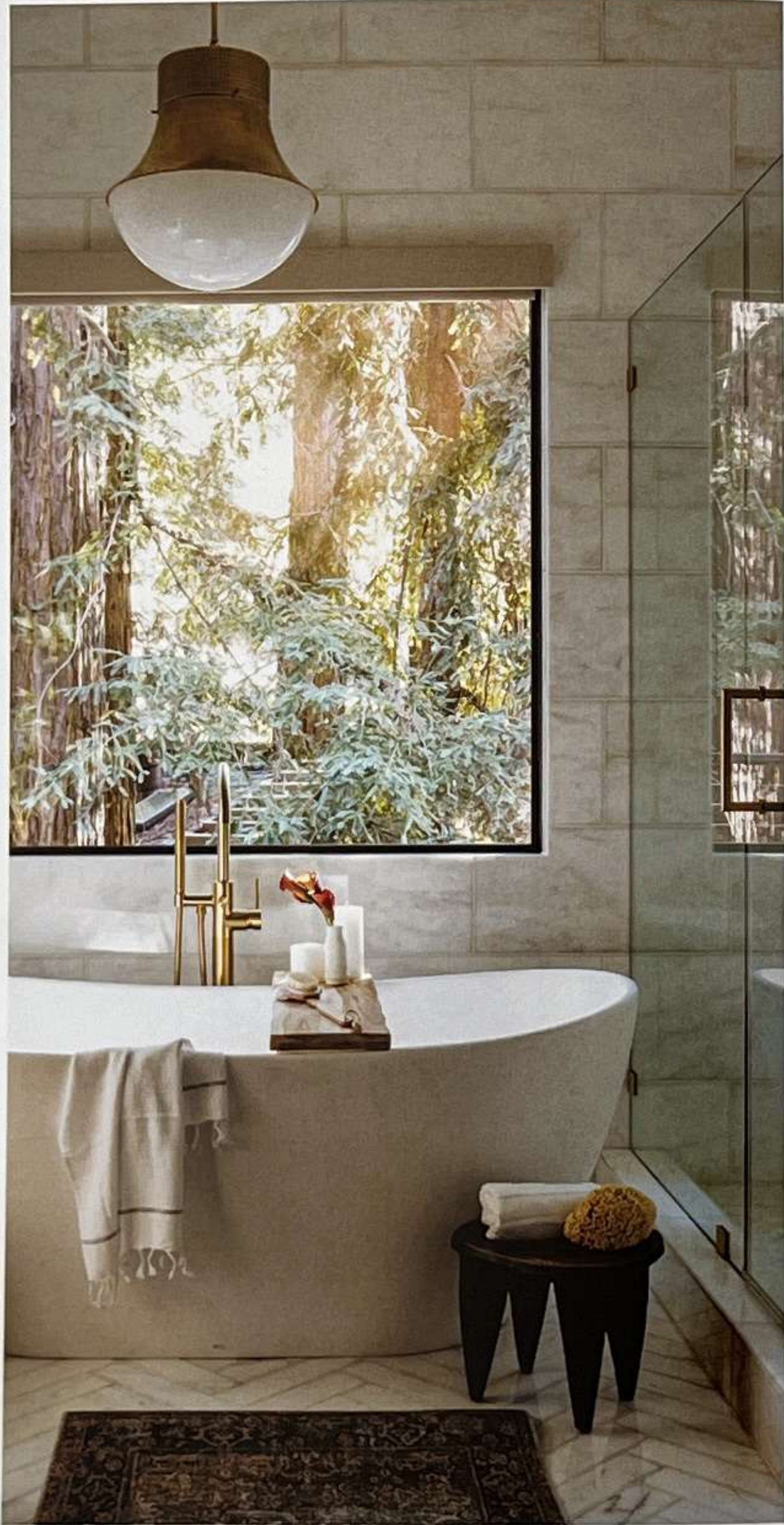
For the overall design, we wanted to ensure that the house felt integrated with the outdoors, as the property is sitting on an acre of redwoods. It was important to the clients to utilize as many natural materials as possible. In the primary bathroom, we achieved this organic integration by maximizing the picture window above the freestanding stone tub and using a lot of texture and movement throughout the space. White oak wood is a stunning choice for the cabinetry and built-ins, while gorgeous marble adds polish in a herringbone format for the floors and a larger format for the shower walls. The black quartz countertop adds a layer of drama to complete the space. Designed by Natalia Avalos Interiors, San Francisco, CA, page 366

"A home should be just as functional as it is beautiful and tell the story of the people that inhabit the space. It should reflect their lifestyle, likes, and most importantly personalities. All these elements come together to create the essence of what we call home." —Natalia Avalos