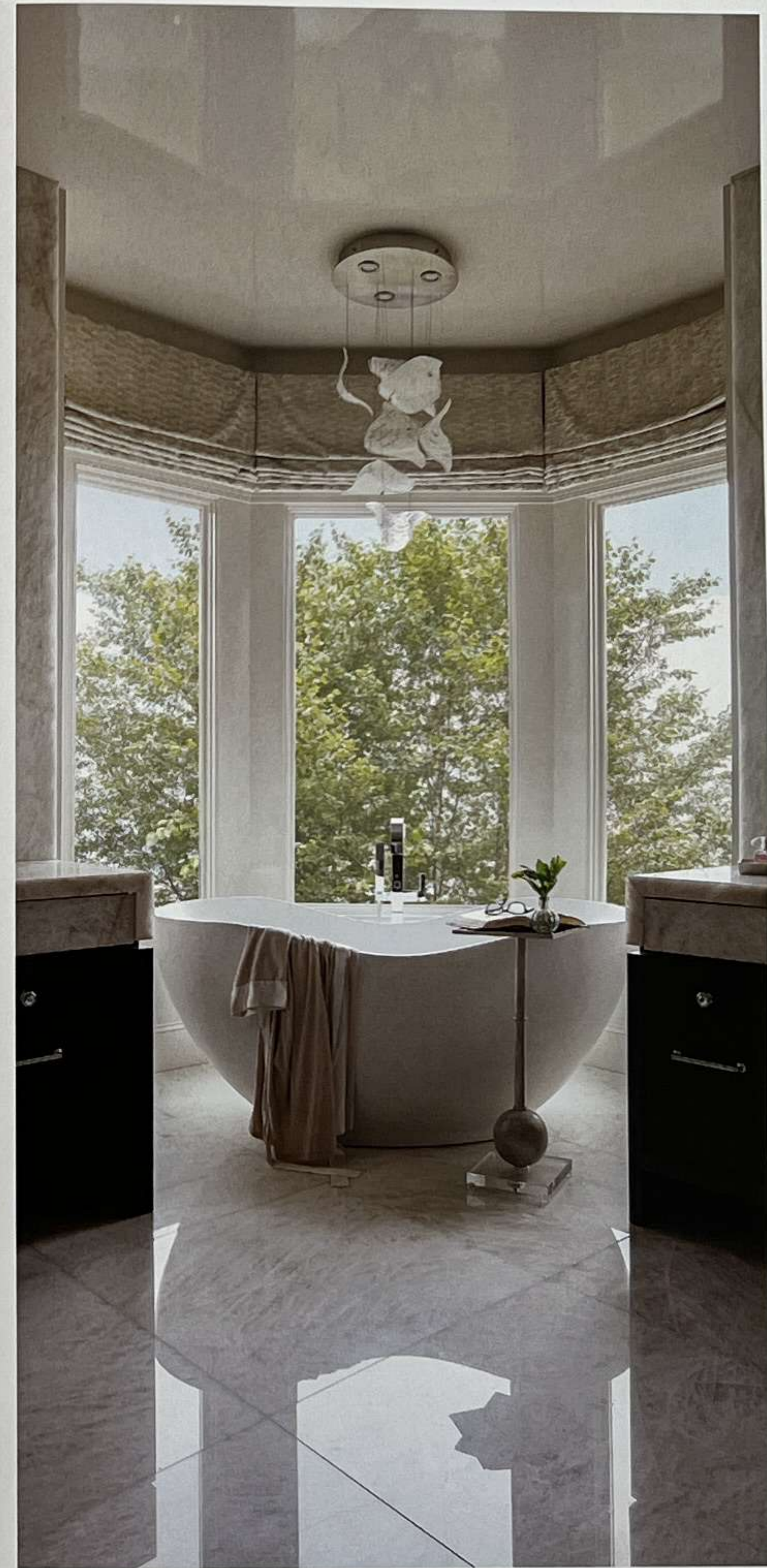
Designed by LGB Interiors, Columbia, SC, page 365